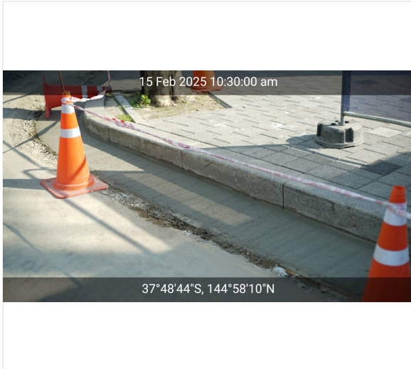
Photo 1: Curb repair complete. Intersection of Koala St. and Kangaroo Ave.